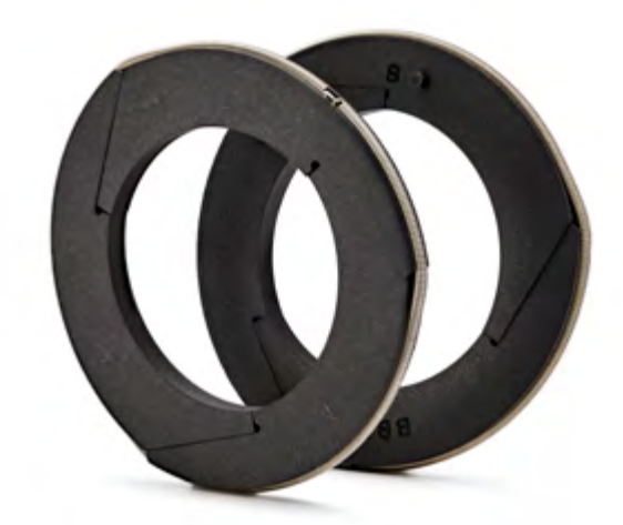
TruTech P1150 material provides proven rod packing performance under reduced lubrication rates

For example, applying an optimized lubrication strategy with TruTech P1150 sealing components on an average size natural gas reciprocating compressor has generated lubrication consumption savings of $9.63 per day, or $2,100 per year. This can easily translate to $500,000 to $1,000,000 in annual savings for a large fleet of compressors.